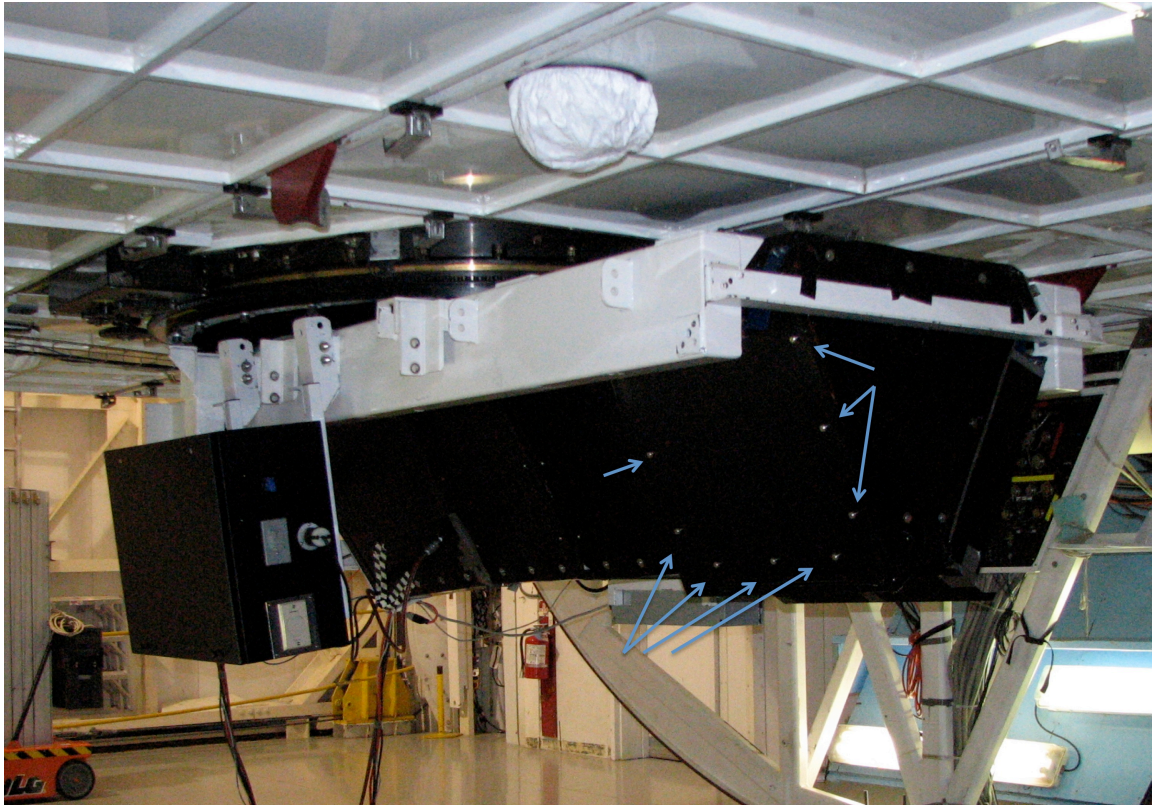
Photo of the spectrograph mounted on the MMT, with the captive screws of the cover indicated by blue arrows. Loosen these and remove the black panel to access the grating.

This photo was taken when the guider cooler was still in the black CCD electronics box. The guider cooler is now mounted from the white frame, near the grating access.