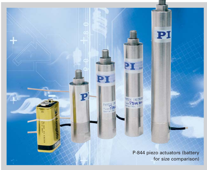
P-844 piezo actuators (battery for size comparison)