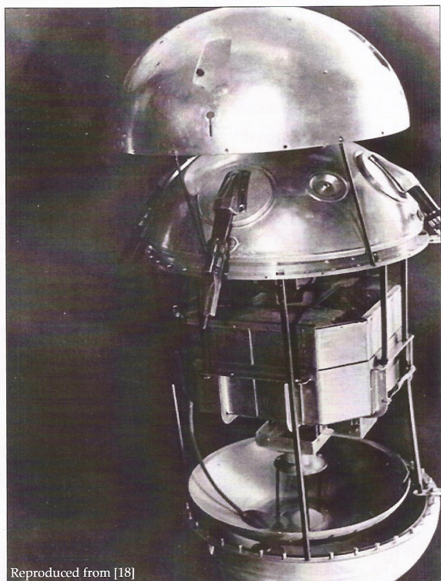
Reproduced from [18]

become teachers at the college level after graduate school and ultimately increased the quality of teachers [13].