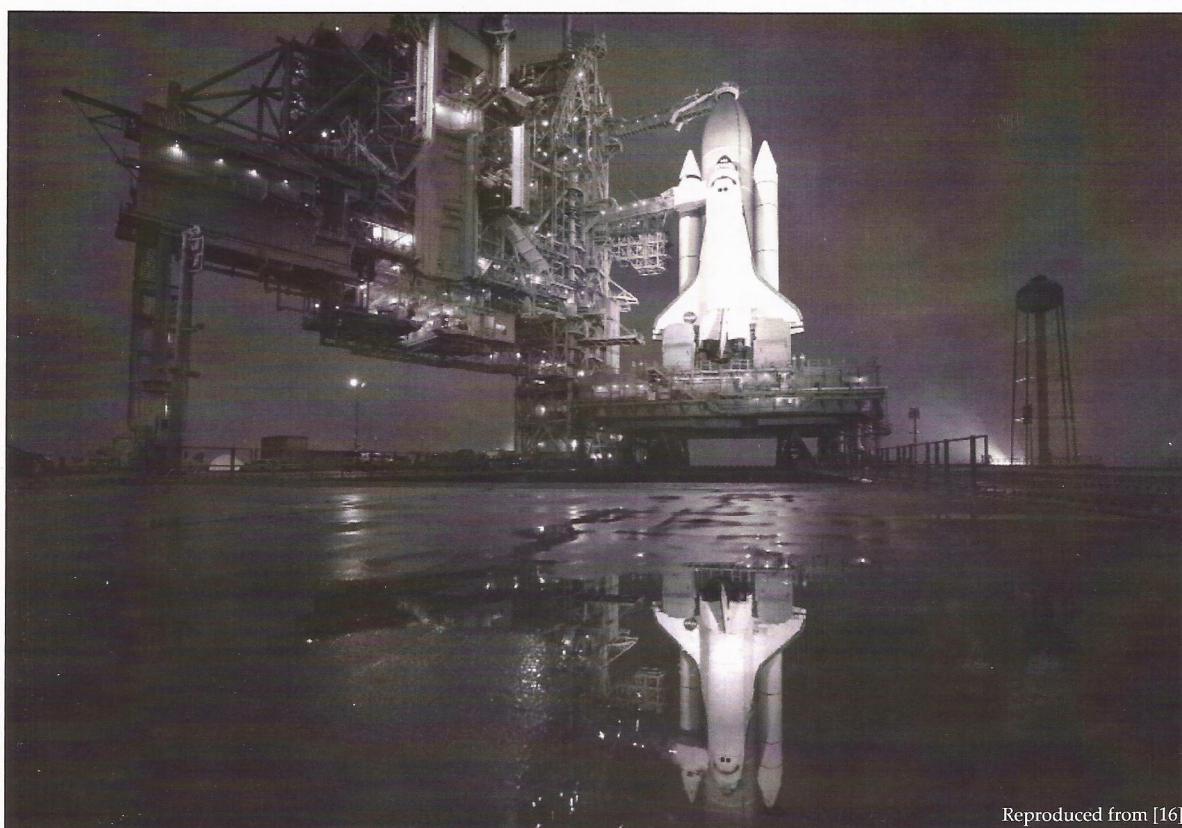
Reproduced from [16]

pump—known as the Left Ventricular Assist Device. This device has the power to pump blood in the heart for up to a year, a feat that can keep patients alive should they need to wait for a donor [2]. Similarly, NASA has helped out firefighters with their jobs as well. In order to study the rocket fuel being dispersed from the Space Shuttle during liftoff, NASA created better infrared cameras called QWIPs (Quantum Well Infrared Photodetectors) [3]. Firefighters can also use these QWIPs to identify dangerous hot spots in brushfires via satellite [4].