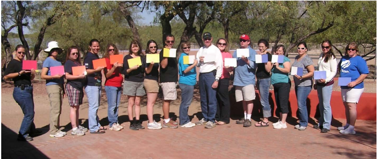
Group of Girl Scout Leaders with Constellation Cards

12. NOTE: If you use the cards from the prepared kit or have mounted the two-color star cards as described below in the Procedure , and if you form the U-shape with the opening facing front and the cooler stars beginning at the left point, flipping the cards from top-to-bottom should form a perfect spectrum, with the orange half of the yellow-orange cards nearest the orange stars and the yellow half nearest to the yellow stars. The same will be true for the yellow-white and blue-white cards. When the colored sides of the cards are facing away from the students, the constellations and the star information should be upside down. If some students turn the cards from right-to-left instead of flipping them, the two-color cards may need to be adjusted to show the correct order.