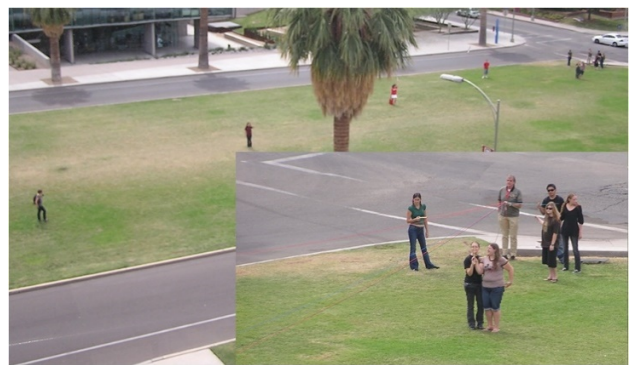
Scale model of planet distances