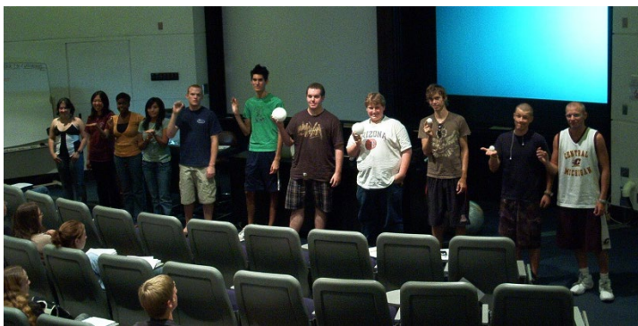
Scale model of planet diameters

Remind them that this is a scale model of the distances from the Sun to the planets in the Solar System. Tell them that, as they stand at the ends of the macramé and look back at the “Sun,” the bead is what the Sun would look like from that planet. Also, while they are not lined up, in the real Solar System, the individual planets are all moving around the Sun at different speeds. Finally, on this scale, the next nearest star is about 250 miles away. For older girls, you might mention that the orbits of the planets are not circular and that this model is showing just the average distances of the planets from the Sun.